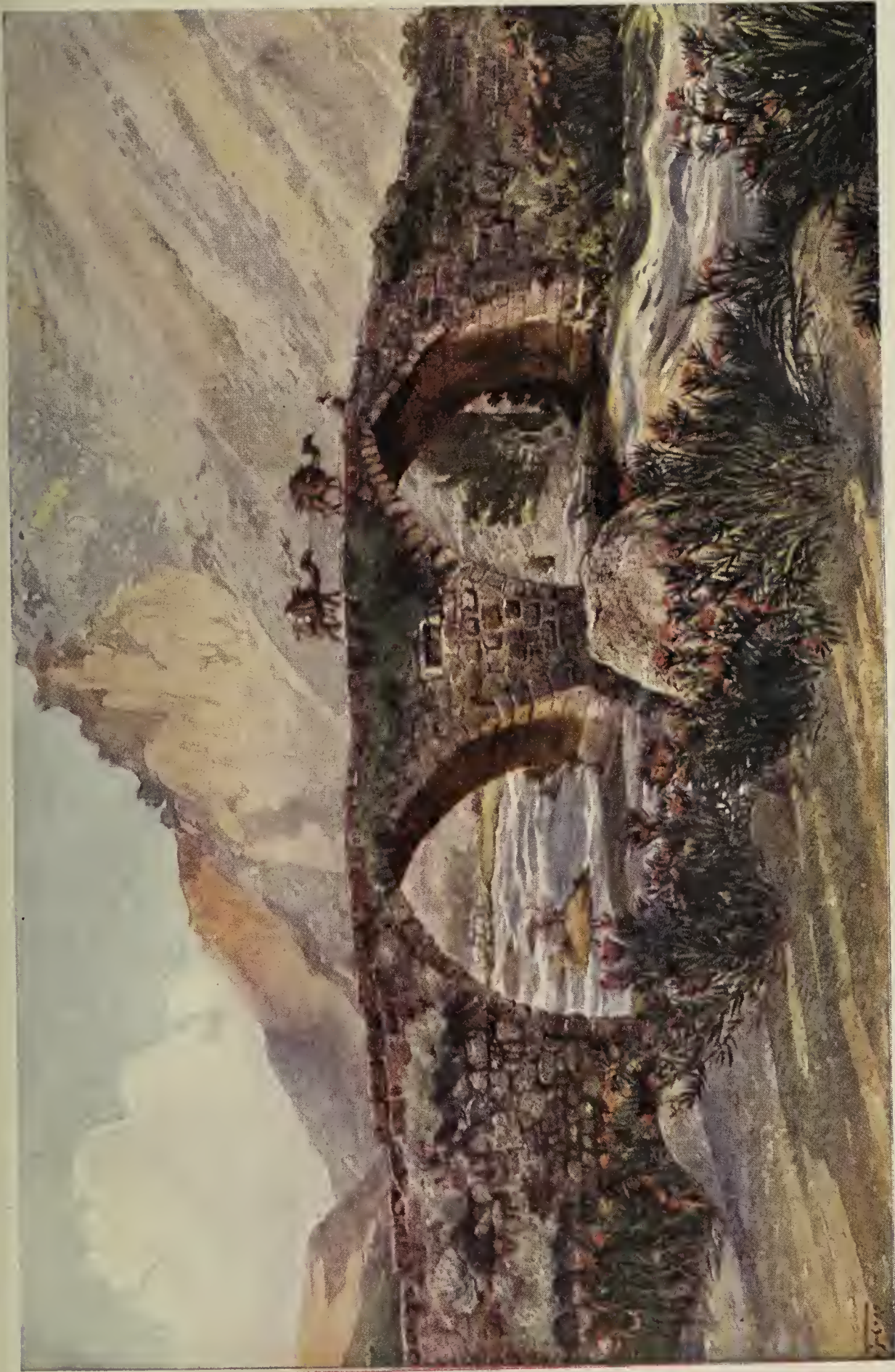
Bridge Over the River Litani.